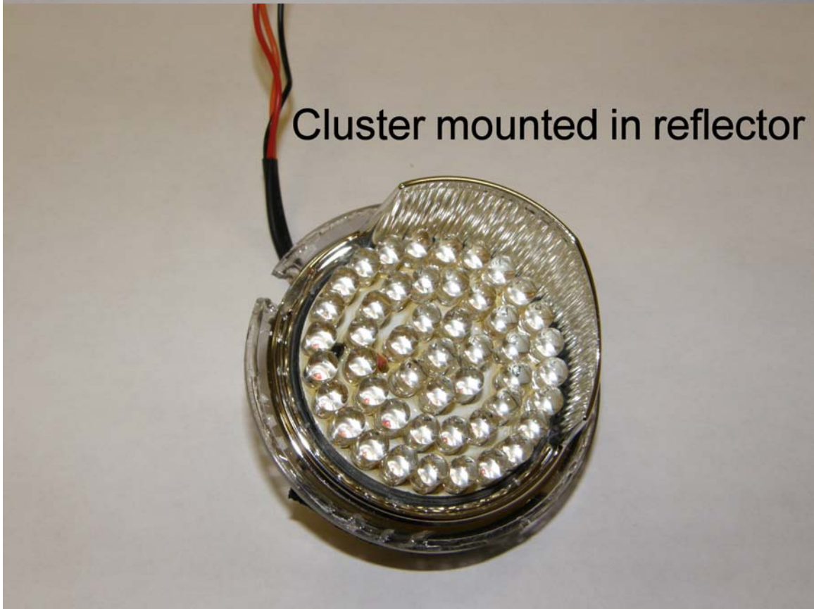
Cluster mounted in reflector