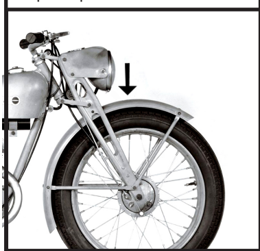
Step 7: Optic Sensor Placement.

Note: fluorescent or LED lighting will not activate the module; to test use an incandescent light source or move outdoors.