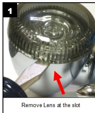
Remove Lens at the slot