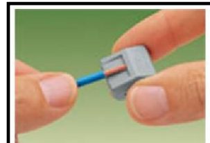
Strip wire 9-10 mm. Use wire gauge on bottom to verify.

Safety: Always follow safe working practices including safety gear and the proper tools. Make sure the vehicle is cool enough to touch and is secured on a level surface.