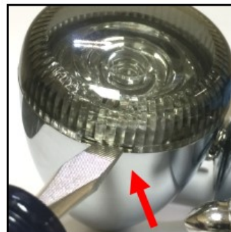
Remove Lens at the slot

Note: 2013 & Earlier Sportsters®, 2011 & Earlier Dynas®, 2010 & Earlier Softails®, 2013 & Earlier H-D™ Touring and H-D™ Trikes and all V-Rod® Models require a SMART Signal Stabilizer™ or Load Equalizer to ensure proper function and flash speed of LED Turn Signals.