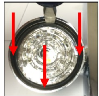
Gently pry around the perimeter