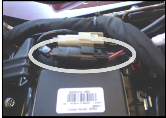
Harness Connector Location—on top of ECM

For: Road King, Electra Glide Ultra Classic, Electra Glide Ultra Classic Lo, Electra Glide Ultra Limited, Electra Glide Ultra Limited Lo, Road Glide Ultra CVO