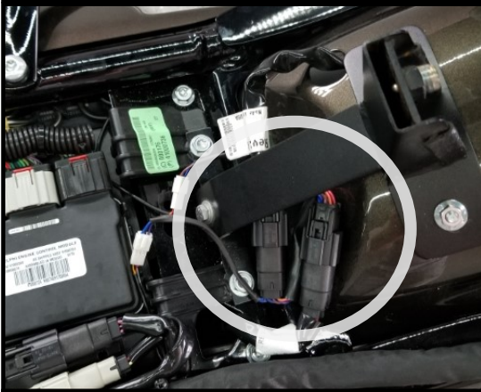
Harness Connector Location—Top Rear Fender

For: Road King, Electra Glide Ultra Classic, Electra Glide Ultra Classic Lo, Electra Glide Ultra Limited, Electra Glide Ultra Limited Lo, Road Glide Ultra CVO