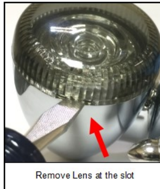
Remove Lens at the slot

Note: 2013 & Earlier Sportsters®, 2011 & Earlier Dynas®, 2010 & Earlier Softails®, 2013 & Earlier H-D™ Touring and H-D™ Trikes and all V-Rod® Models require a SMART Signal Stabilizer™ or Load Equalizer to ensure proper function and flash speed of LED Turn Signals.