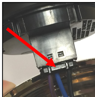
Push Connector Tab and pull bulb off the connector

Questions? Call us at: 1 (800) 382-1388 M-TH 8:30AM-5:30PM / FR 9:30AM-5:30PM EST