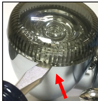
Remove Lens at the slot