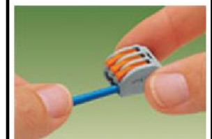
Then push down lever to its closed position.

Questions? Call us at: 1 (800) 382-1388 M-TH 8:30AM-5:30PM / FR 9:30AM-5:30PM EST