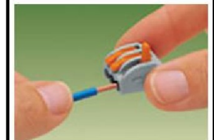
Push Lever up and insert wire...