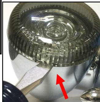
Remove Lens at the slot

Note: Custom Dynamics® smoked or clear motorcycle turn signal lens (sold separately) required for proper installation. OEM lenses are not compatible.