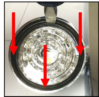
Gently pry around the perimeter